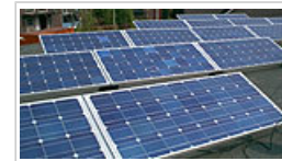
Governments must enhance deployment programmes, for technologies such as solar energy

Most new technologies have higher costs than established ones, but it is only through their deployment that costs can be reduced and the product adapted to the market. Governments must enhance deployment programmes, especially for technologies with the greatest potential such as biofuels and solar energy.