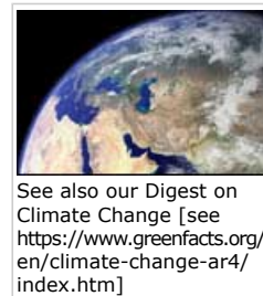
See also our Digest on Climate Change [see https://www.greenfacts.org/en/climate-change-ar4/index.htm ]

2.3 These required additional investments do not represent net costs, because technology investments in energy efficiency, in many renewable energy sources and in nuclear power all reduce fossil fuel requirements. In fact, in both ACT and BLUE scenarios, the estimated total undiscounted fuel cost savings for coal, oil and gas consumers over the period to 2050 are greater than the additional investment required.