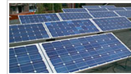
Governments must enhance deployment programmes, for technologies such as solar energy

Most new technologies have higher costs than established ones, but it is only through their deployment that costs can be reduced and the product adapted to the market. Governments must enhance deployment programmes, especially for technologies with the greatest potential such as biofuels and solar energy.