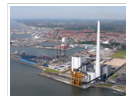
The Esbjerg Power Station, a CO 2 capture site in Denmark

Some of the technologies needed to reach the targets set in the most ambitious scenarios are not yet available, and many others require further refinement and cost reductions. A huge effort of research, development, and demonstration (RD&D) is therefore urgently needed, both in the public and the private sector. It is estimated that the public sector needs to increase research and development investments by as much as ten times the current amounts.