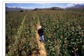
Farmer in a field of maize in Bolivia

Genetic engineering may accelerate the damaging effects of agriculture, have the same impact as conventional agriculture, or contribute to more sustainable agricultural practices and the conservation of natural resources, including biodiversity.