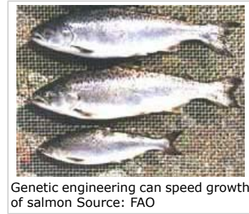
Genetic engineering can speed growth of salmon

Reports addressing those potential environmental concerns recommend that genetically modified animals should be evaluated in comparison with their conventional counterparts.