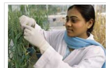
Work on wheat at the Indian Agricultural Research Institute.

It is often a very effective way of producing very large numbers of nearly identical plants from one individual plant with desired characteristics. This technique is extensively used in hundreds of laboratories around the world for example for generating disease-free banana plants, and has potential applications in forestry.