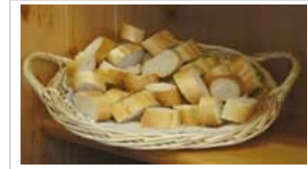
The use of yeast to make bread is an example of traditional biotechnology

Biotechnology can be described as any technology that uses living organisms to make or modify a product for a practical purpose. Some traditional techniques have been used for thousands of years. Natural yeasts, for instance, have been used to make bread, beer, and wine through a process called fermentation.