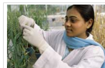
Work on wheat at the Indian Agricultural Research Institute.

It is often a very effective way of producing very large numbers of nearly identical plants from one individual plant with desired characteristics. This technique is extensively used in hundreds of laboratories around the world for example for generating disease-free banana plants, and has potential applications in forestry.