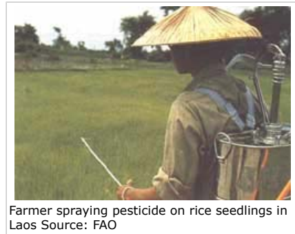
Farmer spraying pesticide on rice seedlings in Laos

Genetically modified crops may have indirect environmental effects as a result of changes in agricultural or environmental practices associated with the new varieties.