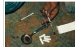
The development of drug addiction can be seen as a learning process

4.1 The development of drug addiction can be seen as a learning process. A person takes a drug and experiences the psychoactive effect, which is highly rewarding or reinforcing, and which activates circuits in the brain that will make it more likely that the person will repeat this behaviour. The brain responds as if taking the drug was important for survival.