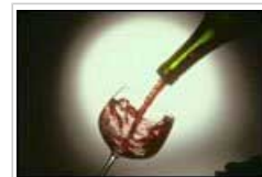
See also GreenFacts' Alcohol Study [see https://www.greenfacts.org/en/alcohol/index.htm ]

2.1 Psychoactive drugs impose a substantial health burden on society. Tobacco and alcohol in particular are major causes of death and disability in developed countries, and the impact of tobacco is expected to increase in other parts of the world.