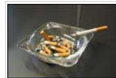
See also GreenFacts' Tobacco Study [see http://www.greenfacts.org/en/tobacco/index.htm ]

2.2 Using psychoactive drugs, be it to find pleasure or to avoid pain, can harm health and cause social problems both in the short and longer term. Health effects can include diseases of the liver or the lungs, cancer, deaths and injuries caused by accidents, overdoses, suicide, and assaults. Examples of social effects include arrests, the breaking up of relationships, as well as neglect of work and family duties.