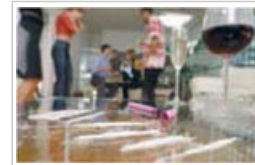
Alcohol and cocaine are examples of psychoactive drugs.

Psychoactive drugs are substances that can alter the consciousness, mood, and thoughts of those who use them. Examples include tobacco, alcohol, cannabis, amphetamines, ecstasy, cocaine, and heroin.