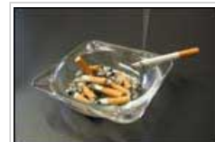
See also GreenFacts' Tobacco Study [see http://www.greenfacts.org/en/tobacco/index.htm ]

2.2 Using psychoactive drugs, be it to find pleasure or to avoid pain, can harm health and cause social problems both in the short and longer term. Health effects can include diseases of the liver or the lungs, cancer, deaths and injuries caused by accidents, overdoses, suicide, and assaults. Examples of social effects include arrests, the breaking up of relationships, as well as neglect of work and family duties.