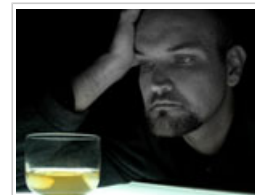
Individuals often suffer from drug problems in combination with depression

Conversely, drug-dependent people are more likely to suffer from mental disorders than non-dependent people. For instance, people who are dependent on alcohol, tobacco, or cocaine are more likely to suffer from depression than non-dependent people.