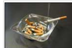
See also GreenFacts' Tobacco Study [see https://www.greenfacts.org/en/tobacco/index.htm ]

2.2 Using psychoactive drugs, be it to find pleasure or to avoid pain, can harm health and cause social problems both in the short and longer term. Health effects can include diseases of the liver or the lungs, cancer, deaths and injuries caused by accidents, overdoses, suicide, and assaults. Examples of social effects include arrests, the breaking up of relationships, as well as neglect of work and family duties.