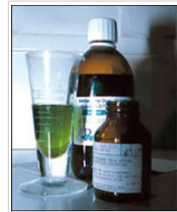
Methadone is a medication used as a substitute for heroin

6.3 The rapid advances in our understanding of how the brain works brings with it a host of new ethical issues in both research and treatment of drug dependence. Biomedical research is guided by moral principles such as ensuring that the benefits to society are greater than the risks to those who consent to treatment or research participation. Ethical issues that need to be addressed include, for instance, equality of access to treatment, the potential treatment of persons without their consent, public funding for treatment of dependence, public credibility of clinical trials, and moral questions arising from animal experimentation and genetic screening.