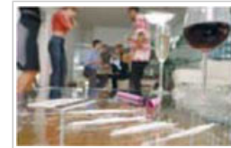
Alcohol and cocaine are examples of psychoactive drugs.

Psychoactive drugs are substances that can alter the consciousness, mood, and thoughts of those who use them. Examples include tobacco, alcohol, cannabis, amphetamines, ecstasy, cocaine, and heroin.