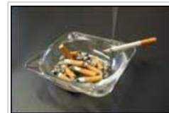
See also GreenFacts' Tobacco Study [see https://www.greenfacts.org/en/tobacco/index.htm ]

2.2 Using psychoactive drugs, be it to find pleasure or to avoid pain, can harm health and cause social problems both in the short and longer term. Health effects can include diseases of the liver or the lungs, cancer, deaths and injuries caused by accidents, overdoses, suicide, and assaults. Examples of social effects include arrests, the breaking up of relationships, as well as neglect of work and family duties.