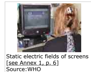
Static electric fields of screens [see Annex 1, p. 6]

Friction, for example from walking on a carpet, can generate strong static electric fields and lead to sparks.