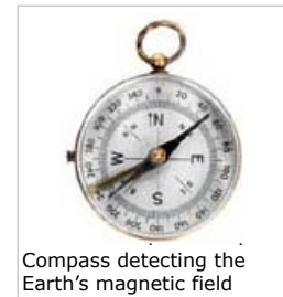
Compass detecting the Earth's magnetic field

Such static fields are different from fields that change over time, such as those generated by appliances using alternating current (AC) or by cell phones etc.