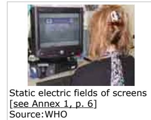
Static electric fields of screens [see Annex 1, p. 6]

Friction, for example from walking on a carpet, can generate strong static electric fields and lead to sparks.