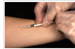
Traditional skin tests do not detect drug resistance.

In order to gather information on drug-resistant tuberculosis it is necessary to organize surveys and repeat them. This requires sufficient laboratories capable of performing drug resistance tests, staff to interview and classify the patients, and a transport network to send samples for analysis to different laboratories inside and outside the country. These facilities are not available in all countries, particularly those where relatively large proportions of the population are affected. It would also be desirable to have large samples of patients classified in sub-categories according to their previous treatment history, to test patients for HIV and to perform second-line drug resistance tests. All these come at great additional expense and workload. That is why surveys tend to be repeated infrequently.