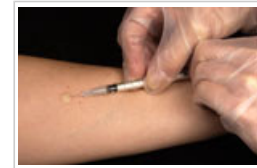
Traditional skin tests do not detect drug resistance.

In order to gather information on drug-resistant tuberculosis it is necessary to organize surveys and repeat them. This requires sufficient laboratories capable of performing drug resistance tests, staff to interview and classify the patients, and a transport network to send samples for analysis to different laboratories inside and outside the country. These facilities are not available in all countries, particularly those where relatively large proportions of the population are affected. It would also be desirable to have large samples of patients classified in sub-categories according to their previous treatment history, to test patients for HIV and to perform second-line drug resistance tests. All these come at great additional expense and workload. That is why surveys tend to be repeated infrequently.