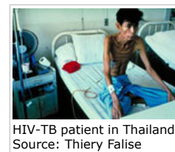
HIV-TB patient in Thailand.

Tuberculosis can be very difficult to detect in people who are HIV-positive. Tests to detect tuberculosis are often negative in people infected with both HIV and TB, which can cause delays in the diagnosis. In addition, people infected with dormant tuberculosis bacteria can quickly become sick with tuberculosis when their immune systems are weakened by HIV. This, together with the difficulty of treating both diseases at the same time, has led to high death rates in people living with TB and HIV.