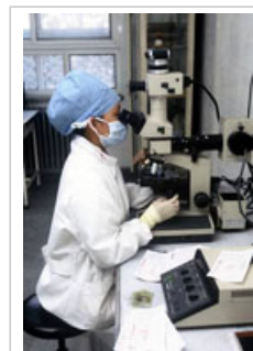
A network of supra-national laboratories supports the national laboratory network.

The Global Project on Anti-tuberculosis Drug Resistance Surveillance was set up in 1994 by the WHO, the International Union Against Tuberculosis and Lung Disease and other partners. Its aims are to estimate the levels of resistance to anti-TB drugs throughout the world and see how these change with time, to develop plans to prevent and tackle drug resistance and to evaluate the progress of these plans.