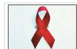
See also our AIDS Digest. [see https://www.greenfacts.org/en/aids/index.htm ]

Tuberculosis is one of the opportunistic infections closely associated with HIV and there have been many outbreaks of drug-resistant forms of tuberculosis in places where large numbers of HIV-positive patients are in close contact with each other such as some hospitals and prisons. However, information on how tuberculosis is transmitted in these particular settings cannot be used to predict the spread of drug-resistant tuberculosis in the general population. This is an important point because people infected with both HIV and tuberculosis develop the disease quickly and, if they are infected with MDR-TB, they could start an outbreak of drug-resistant tuberculosis.