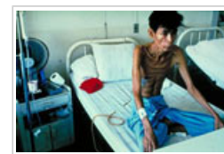
HIV-TB patient in Thailand.

Tuberculosis can be very difficult to detect in people who are HIV-positive. Tests to detect tuberculosis are often negative in people infected with both HIV and TB, which can cause delays in the diagnosis. In addition, people infected with dormant tuberculosis bacteria can quickly become sick with tuberculosis when their immune systems are weakened by HIV. This, together with the difficulty of treating both diseases at the same time, has led to high death rates in people living with TB and HIV.