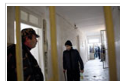
TB Patients in a prison in Tbilisi, Georgia.

It is estimated that 1 to 1.5 million people worldwide are living with multidrug-resistant tuberculosis. In 2006, one in every 20 of all new cases of tuberculosis was multidrug-resistant. Of the nearly half a million people who became ill with multidrug-resistant tuberculosis, 50% were in China and India, and 7% in the Russian Federation.