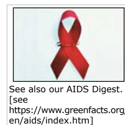
See also our AIDS Digest. [see https://www.greenfacts.org/en/aids/index.htm ]

Tuberculosis is one of the opportunistic infections closely associated with HIV and there have been many outbreaks of drug-resistant forms of tuberculosis in places where large numbers of HIV-positive patients are in close contact with each other such as some hospitals and prisons. However, information on how tuberculosis is transmitted in these particular settings cannot be used to predict the spread of drug-resistant tuberculosis in the general population. This is an important point because people infected with both HIV and tuberculosis develop the disease quickly and, if they are infected with MDR-TB, they could start an outbreak of drug-resistant tuberculosis.