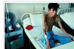
HIV-TB patient in Thailand.

There is a clear association between tuberculosis and HIV. People infected with dormant tuberculosis bacteria can quickly become sick with tuberculosis when their immune systems are weakened by HIV. Tuberculosis can be very difficult to detect in people who are HIV-positive, which can cause delays in diagnosis. This, together with the difficulty of treating both diseases at the same time, has led to high death rates in people living with TB and HIV.