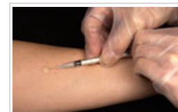
Traditional skin tests do not detect drug resistance.

Collecting reliable information on drug-resistant tuberculosis is expensive, time-consuming and technically complicated. In order to monitor the worldwide spread of drug-resistant tuberculosis over time, it is necessary to test large numbers of samples, and the database of results should include useful information such as the HIV status of the patients, their medical history and other background data. This requires sufficient laboratories to perform drug resistance testing, staff to interview and classify patients and a transport network to send samples for analysis to different laboratories inside and outside the country. These facilities are expensive and not available in many countries, particularly those with the highest burden of tuberculosis.