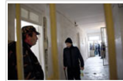
TB Patients in a prison in Tbilisi, Georgia.

3.1 Worldwide, between 1 and 1.5 million people are living with multidrug-resistant tuberculosis (MDR-TB). In 2006, there were nearly half a million new cases in the world.