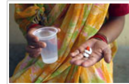
Patients need to be registered into a suitable treatment programme.

7.1 In 2006, approximately half a million new cases of multidrug-resistant tuberculosis (MDR-TB) emerged in the world, with the disease affecting almost every country. The highest proportion of MDR-TB among all TB cases is found in the former Soviet Union. In absolute numbers, the worst affected country is China.