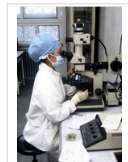
A network of supra-national laboratories supports the national laboratory network.

A network of 26 supra-national reference laboratories supports countries by providing them with drug resistance testing, by giving them technical help, by checking the quality of the tests performed by the national laboratories and by collecting reliable data. The main priorities for the network are to expand in order to meet the demand for reference laboratories and to obtain regular funding.