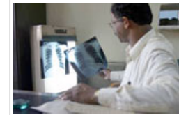
The number of new TB cases in India is very large.

5.2 In most countries in North and South America only a small proportion of cases of tuberculosis are drug-resistant. In North America , levels of drug-resistant tuberculosis are declining. In South America , Peru, Ecuador and Brazil are the worst affected countries, with Peru alone reporting one third of all new multidrug-resistant cases in 2006.