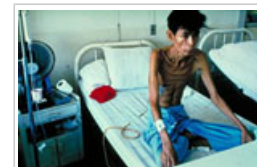
HIV-TB patient in Thailand.

There is a clear association between tuberculosis and HIV. People infected with dormant tuberculosis bacteria can quickly become sick with tuberculosis when their immune systems are weakened by HIV. Tuberculosis can be very difficult to detect in people who are HIV-positive, which can cause delays in diagnosis. This, together with the difficulty of treating both diseases at the same time, has led to high death rates in people living with TB and HIV.