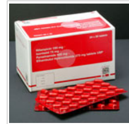
TB can be treated with antibiotics.

Many people who are infected with the tuberculosis bacterium will never become ill because the infection is kept under control by their immune system and the infectious tuberculosis bacteria remain dormant. However, if the infection becomes active, the person will become ill and have symptoms such as coughing, weight loss, fever and chest pains. People with a weakened immune system, particularly those who are also infected with HIV, have a greater chance of becoming sick with TB.