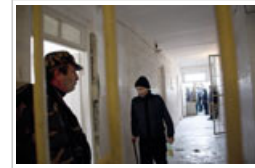
TB Patients in a prison in Tbilisi, Georgia.

3.1 Worldwide, between 1 and 1.5 million people are living with multidrug-resistant tuberculosis (MDR-TB). In 2006, there were nearly half a million new cases in the world.