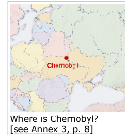
Where is Chernobyl? [see Annex 3, p. 8]

The accident occurred on 26 April 1986 when operators of the power plant ran a test on an electric control system of one of the reactors. The accident happened because of a combination of basic engineering deficiencies in the reactor and faulty actions of the operators: the safety systems had been switched off, and the reactor was being operated under improper, unstable conditions, a situation which allowed an uncontrollable power surge to occur.