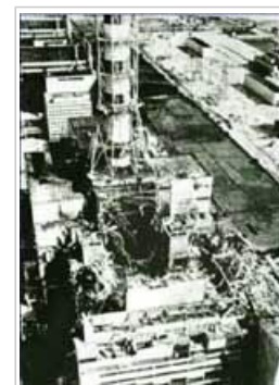
The destroyed reactor

The Chernobyl accident is the most serious accident in the history of the nuclear industry. Indeed, the explosion that occurred on 26 April 1986 in one of the reactors of the nuclear power plant, and the consequent fires that lasted for 10 days, led to huge amounts of radioactive materials being released into the environment and a radioactive cloud spreading over much of Europe. The greatest contamination occurred around the reactor in areas that are now part of Belarus, Russia, and Ukraine.