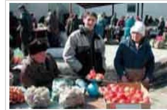
Local market

5.2 The agricultural sector was the area of the economy worst hit by the effects of the accident. Moreover it has been badly affected by the great economic turmoil of the 1990s. To improve the region's economy, it is necessary to deal not only with contamination but also with the general socio-economic problems that affect many agricultural areas.