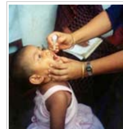
Vaccinations and close monitoring has nearly succeeded in eradicating polio

Although the world was hoping to eradicate polio through vaccination programmes, the disease has re-emerged because of inadequate control. In 2003, the government in Nigeria decided to stop vaccinating children in parts of the country. This resulted in a large outbreak of polio that spread not only throughout Nigeria but also to previously polio-free countries in Africa, Asia and the Middle East. Outbreaks continued to emerge until 2006.