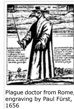
Plague doctor from Rome, engraving by Paul Fürst, 1656

Until relatively recent times, the only way to control the spread of infectious diseases was to separate the sick from the healthy population. It is only since the 19 th and 20 th centuries, that advances in scientific knowledge have made it possible to contain some outbreaks with improved sanitation and the discovery of vaccines.