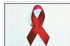
See also the GreenFacts Digest on AIDS [see https://www.greenfacts.org/en/aids/index.htm ]