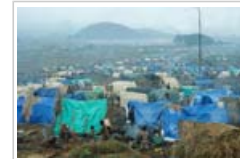
Some 50 000 Rwandan refugees died of cholera in a crowded camp in 1994

Wars and other armed conflicts often result in the destruction or weakening of health systems, leaving them less able to detect, prevent and respond to infectious disease outbreaks. For instance, the 27-year civil war (1975–2002) in Angola left the country with a severely damaged health infrastructure. As a result, the country was incapable to control the outbreak and spread of the Marburg haemorrhagic fever in 2004–2005, which killed 90% of the 200 people affected. The Angolan authorities, with the support of the international community, launched a massive effort to rebuild its infrastructure, but despite their best attempts, 70% of the population is still without basic health care.