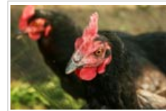
Avian influenza forced the slaughter of millions of domesticated birds.

Avian influenza, also called bird flu, is an emerging epidemic disease that is highly contagious, spreads quickly and easily between domestic and wild birds, and it occasionally infects humans, although it is not passed on between humans. It presents a major threat to life, economies and security. It was first identified in Hong Kong in 1997 and since then there have been 310 reported human cases that have resulted in 189 deaths.